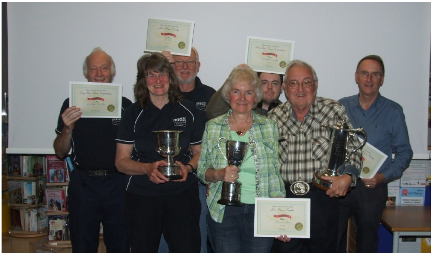
Members of Sutton Coldfield Movie Makers show off their prizes.