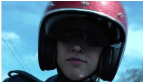
Cally in "Out of the Past"